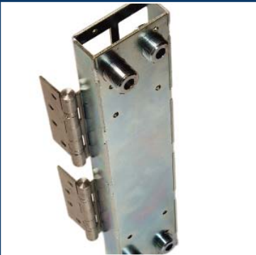
Hinge Chassis System